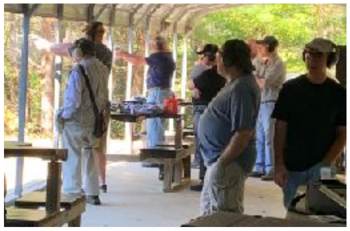
This event was a great chance to try out a variety of firearms.

If you missed "Your Guns or Mine" this year, be sure to watch for it next year – it was a great time and a huge success. The goal of the day was to give people a chance to try out unusual firearms, or something they were considering purchasing, and that goal was achieved. About 30 shooters attended during the two-hour event, and had their choice of