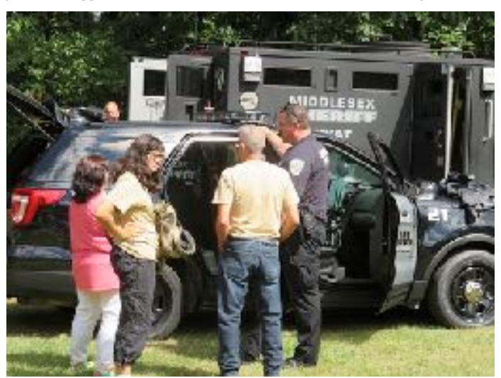
Local residents got a chance to meet Chelmsford first responders.