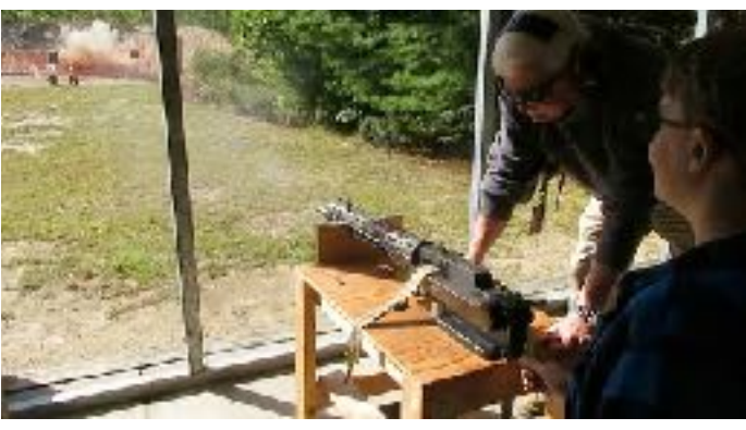
Attendees got a chance to shoot an authentic WWI Maxim machine gun.