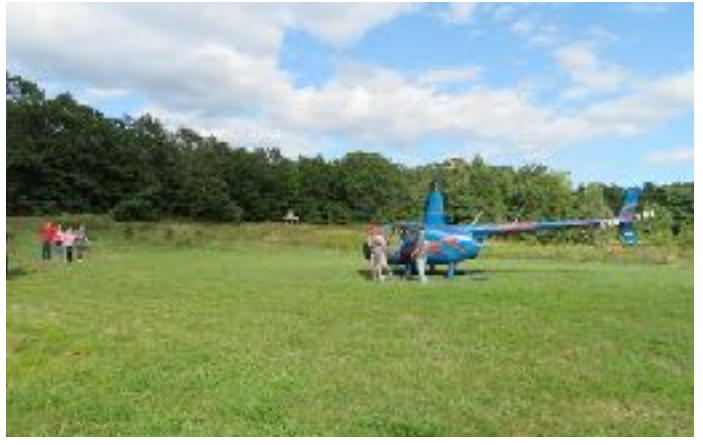
People lined up to ride the helicopter. Everyone coming off had big smiles!

be a big hit (and happily not a big mess). At 1pm many attendees went inside the Clubhouse for the "Reptiles Rock" presentation, with live turtles, lizards, and an enormous snake. In between these activities, breaking clays, plinking, ringing the 100 yard gong, catching fish, burning black powder, and hitting the archery bags, about 60 people also took to the sky for a helicopter ride. Best of all, 12 new people submitted applications during the Open House! Welcome to our new members and thanks to all our members who worked hard to put on another great Open House!